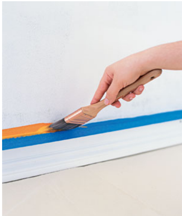
Wendell T. Webber

Brush on paint around trim and in the corners of walls, where your roller can't reach, with a two-inch angled brush. Extend out two to three inches from windows, doors, and moldings.