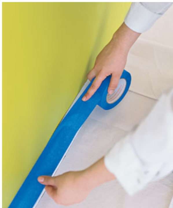
Wendell T. Webber

Be sure to use painter's blue tape, which can be applied up to a week ahead. Remove tape immediately after painting, before the wall dries, so you don't peel off any paint with it.