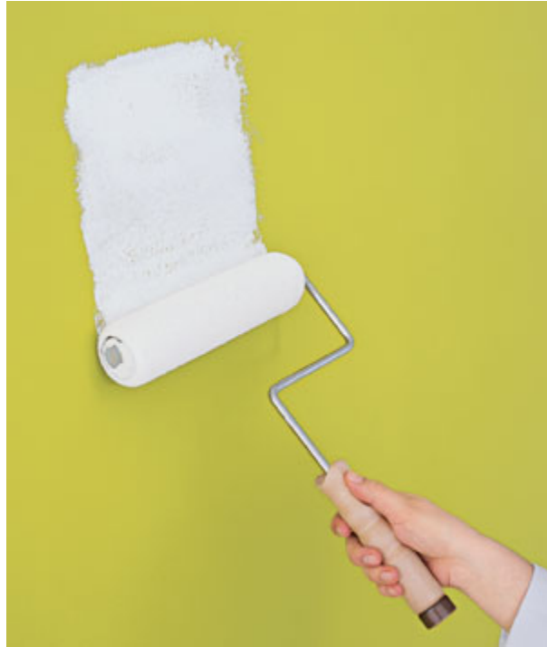
Wendell T. Webber

It's a common myth that walls that have been painted many times don't need to be primed. In fact, primer helps maximize the sheen and coverage of paint and gives the finish coat a more uniform appearance.